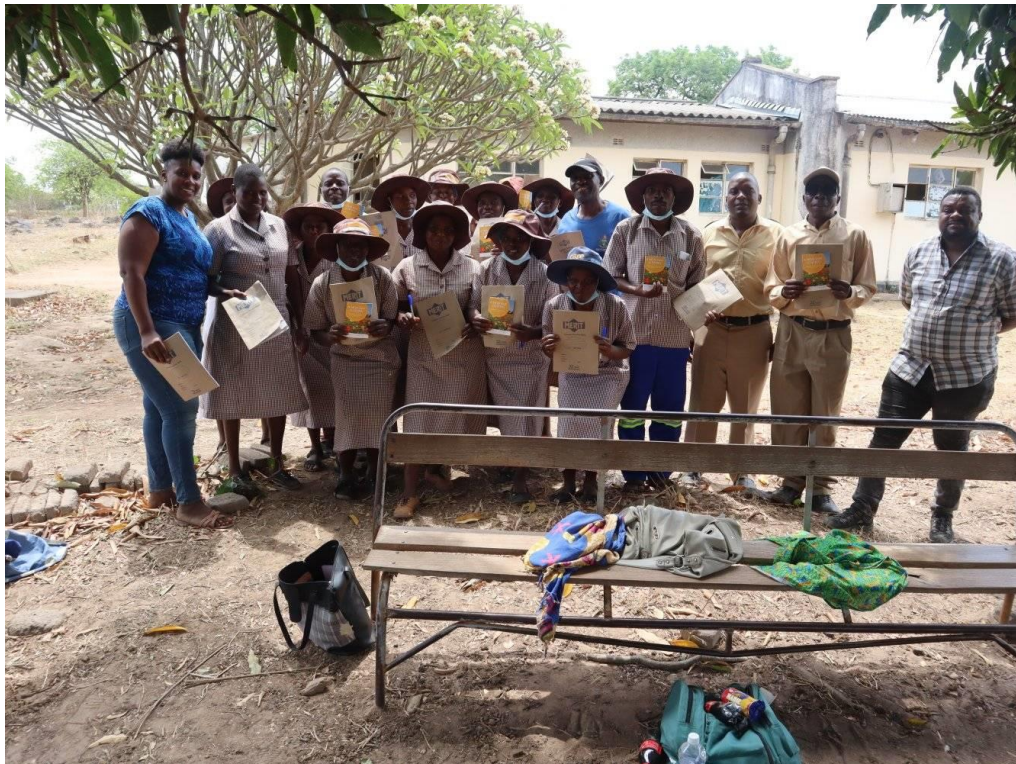
Award Ceremony after VHW training