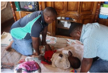
iv) Neuromuscular clinic v) Support group visit vi) Home visit