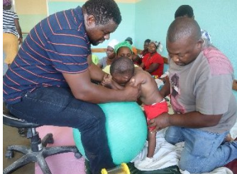
i & ii) VHW Training at Chiredzana and Zibhowa clinics iii) Neuromuscular clinic